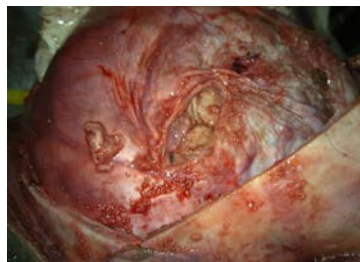
Figure 3. The thick membrane of the brain is torn

At the opening of the skull, it was found that the thick membrane of the right side of the brain was torn apart from the skull fracture with a length of 5 cm and a width of 0.2 cm with a distance of 5 cm from the midline of the body, 5 cm from the right ear.