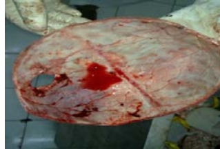
Figure 5. The skull is perforated in the fracture compression area