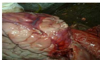
Figure 4. Infiltration of blood

A torn brain tissue about the skull fracture was found, 3 cm long and 2 cm wide.