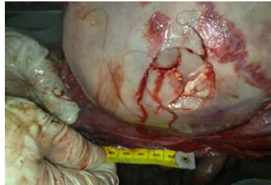
Figure 2. Compression Fracture

He found a fractured skull on the upper right with a length of 4 cm and a width of 4 cm with a depth of 1 cm. From the wound, brain tissue was visible.