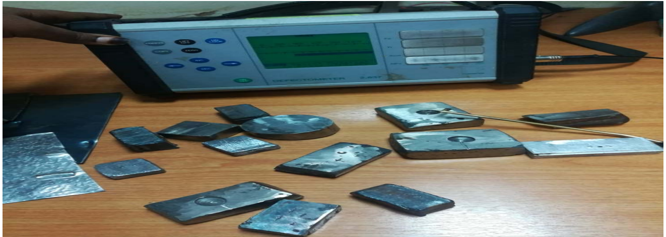
Figure (4.1) shows types of samples used in the thesis and Defect meter model 2.837