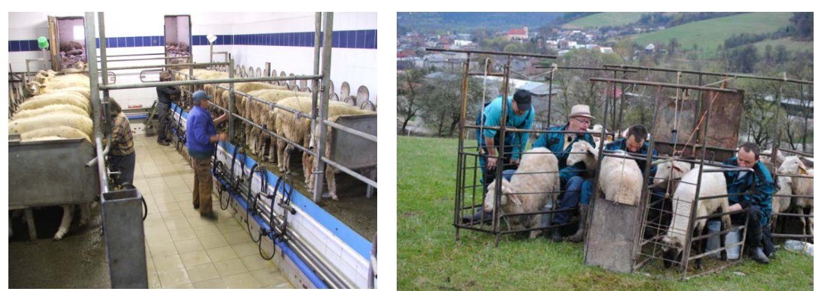
Figure 1: Sheep flock with machine (A) and hand (B) milking

Sheep farm – A, comprised 420 sheep of the Improved Valachian breed, that were housed during the winter in two brick sheep houses on deep bedding that were fitted with feeding troughs and drinkers. Machine milking of sheep was performed in a double-row milking parlour 2 x 12 Miele Melktechnik (Hochreiter Landtechnik, Germany) twice a day after weaning of lambs, during April - September. Before the milking, a dry udder toilet was performed according to Gyarmathy [7]. During milking, the milk was collected in a mobile milk tank and after milking it was immediately transported to a hut for further processing.