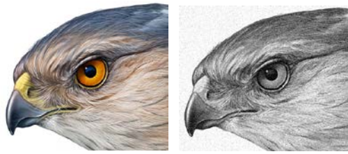
(a) Original image (b) Gaussian noise